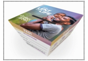
CRS Rice Bowl Banks are in the foyer

Our parish will take up The Catholic Relief Services Collection on Easter. Funds from this collection provide food to the hungry, support displaced refugees, and bring Christ's love and mercy to vulnerable people here and abroad. Please give generously to the collection and reveal Christ's Love to those most in need. 25% of the funds remain in the diocese. Learn more about the collection at www.usccb.org/catholic-relief .